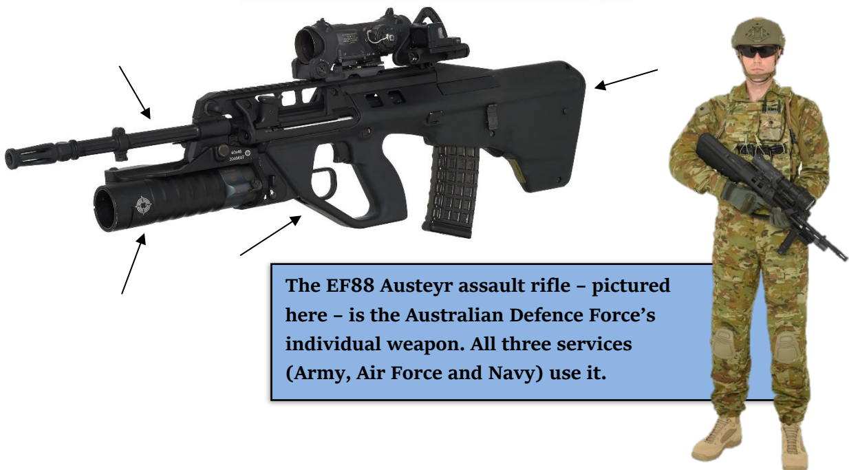
The EF88 Austeyr assault rifle - pictured here - is the Australian Defence Force's individual weapon. All three services (Army, Air Force and Navy) use it.