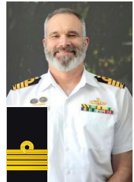
Sub Lieutenant SBLT