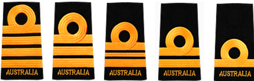
Captain (RAN) CAPT

2) Now let's look at Senior and Junior Officer ranks in the Royal Australian Navy. Look at the ranks below and fill in the gaps.