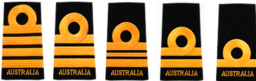
Captain (RAN) CAPT

2) Now let's look at Senior and Junior Officer ranks in the Royal Australian Navy. Look at the ranks below and fill in the gaps.