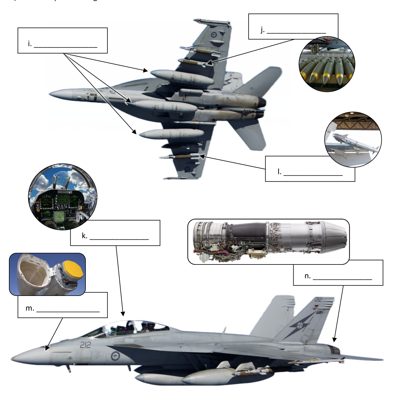
radar // external fuel tanks // cockpit // missile // jet engine // bomb

2) Label the parts of a fighter aircraft. Use the words in the box below.