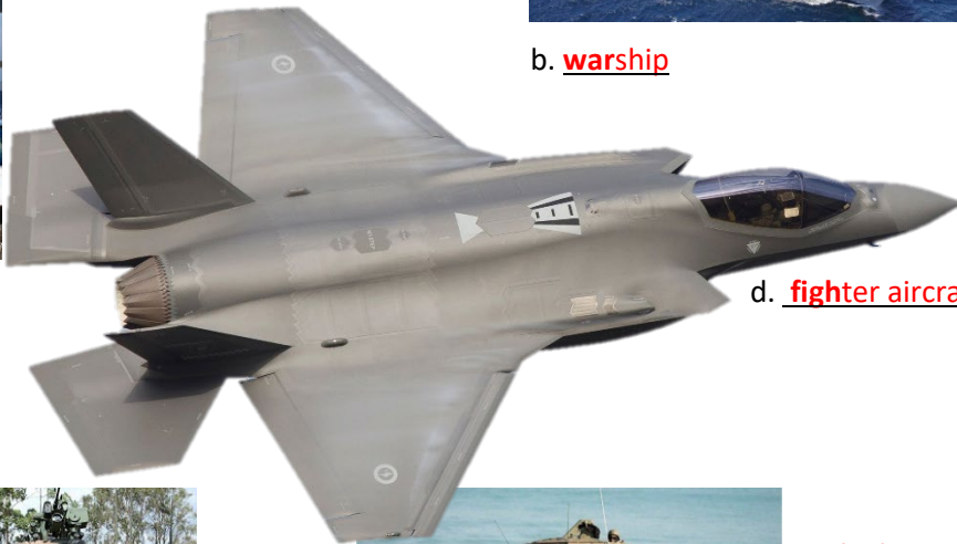
d. fighter aircraft