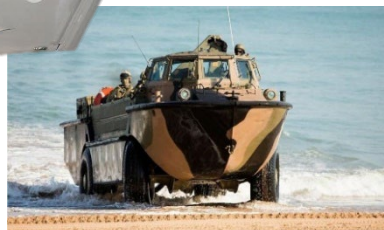
e. (an) amphibious vehicle