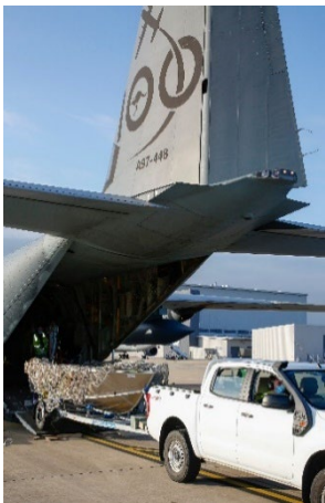
a. Transport aircraft

Let students know that the activity is in 2 parts. Part 1 is on this page and part 2 on the next. Students may know many of these and as such, give them a short amount of time to match whatever they can first. Show the handout on the board, if available, and then point to an image, and elicit the name from the class. If the students get it wrong or don't know, tell them the answer.