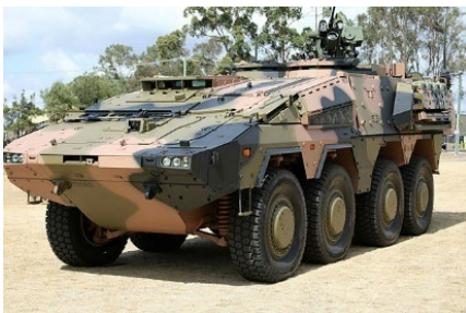
c. (an) armoured vehicle