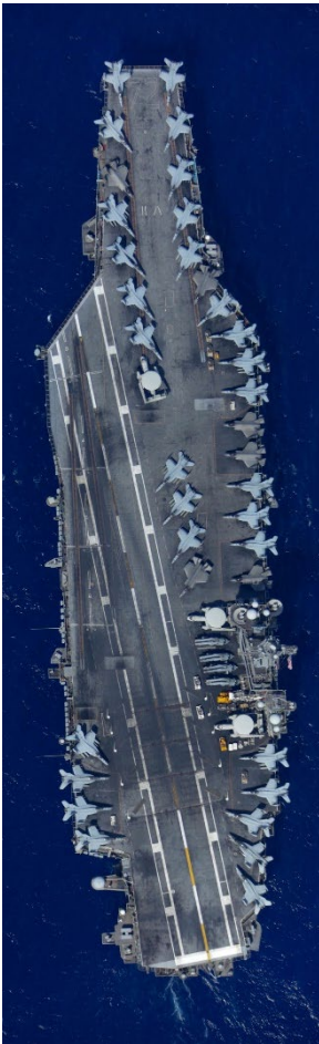
i. (an) aircraft carrier