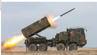
f. rocket launcher

transport aircraft // fighter aircraft // rocket launcher // armoured vehicle // amphibious vehicle // warship