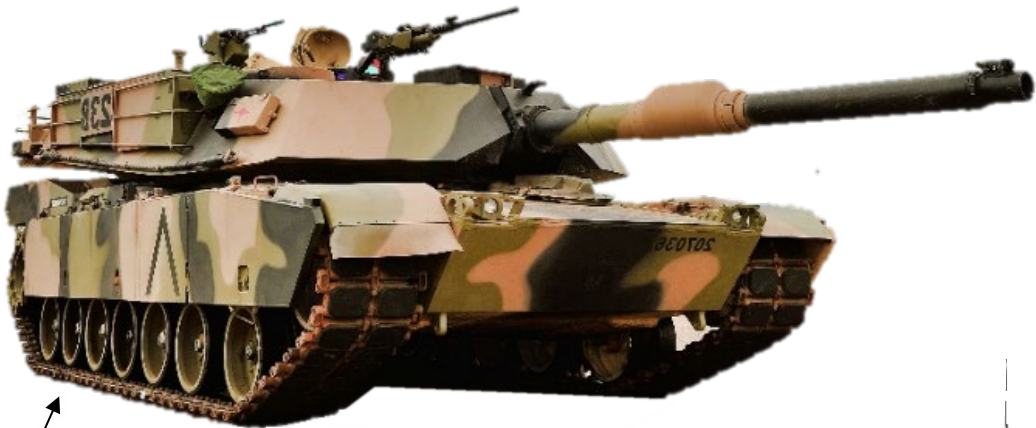
f. main battle tank