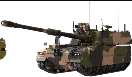
i. self-propelled howitzer