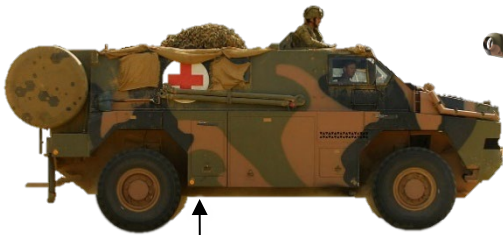
e. medical vehicle (ambulance)

armoured personnel carrier (APC) // amphibious assault vehicle // armoured recovery vehicle // medical vehicle (ambulance) // self-propelled howitzer // main battle tank