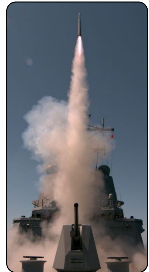
Above: Destroyer HMAS Sydney fires a Sea Sparrow guided missile.

f. If someone or a boat – including a submarine – is in danger or lost at sea, a _____ vessel can be used. These vessels have special equipment like radar and sonar.