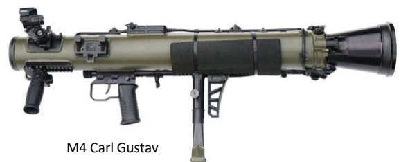
M4 Carl Gustav