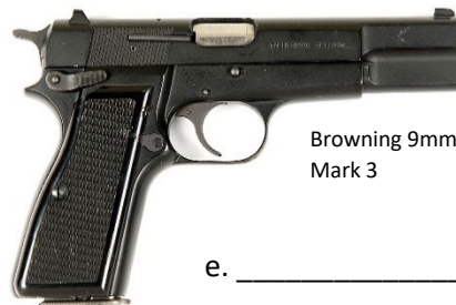
Browning 9mm Mark 3