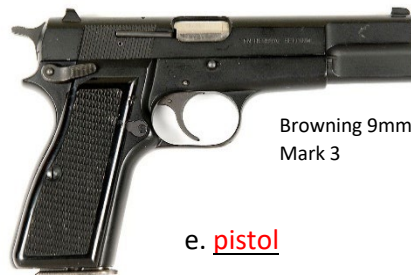
Browning 9mm Mark 3