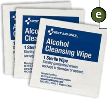
e alcohol wipes

syringe // alcohol wipes // survival blanket // tweezers // eye shield // tourniquet // adhesive tape // gloves