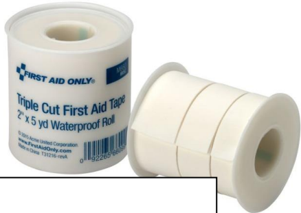
i adhesive tape