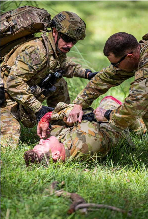
Australian Army medics from 2 nd Health Battalion provide medical care to a simulated casualty during Exercise Viper Walk 2024.

IV fluid // oral pharyngeal // oximeter // giving set // stethoscope // adrenaline ampoule // chest seal