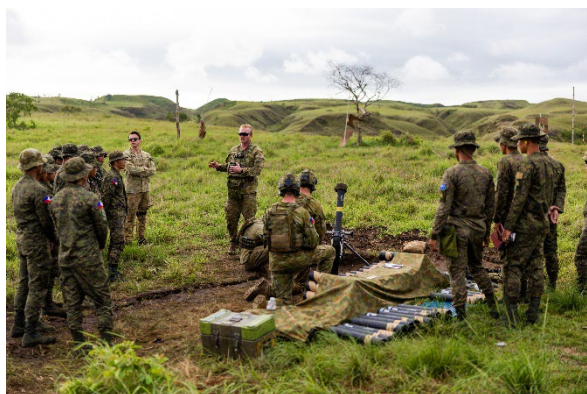
Australian and Philippine Army soldiers during the training activity.

The training team also included a Liaison Officer to help the two armies communicate. Overall, conducting activities like this increases interoperability and builds stronger relationships between Australia and the Philippines.