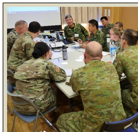
Planners from the Australian Army, United States Army and Japanese Ground Self-Defense Force have a meeting before a joint exercise.