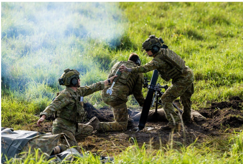
Australian Army soldiers fire an 81mm mortar in Luzon, Philippines.

From sunrise to sunset, the hills of Luzon in the northern Philippines were busy with fire activity from Australian Army mortars during a basic mobile fire controller course.